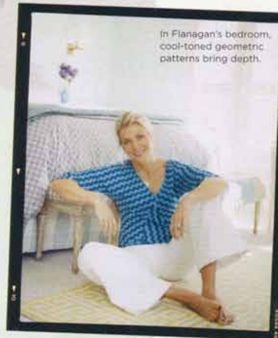
In Flanagan's bedroom, cool-toned geometric patterns bring depth.

Euro shams "Border" in Ocean $80 each, and Dubet and shams set "Hexagon" in Ocean $230 dwellshop.com Quilt Reversible silk $280 anthropologie.com Bench Gustavian with "Seabreeze" fabric $2,400 Mecox Gardens (312) 836-0571 Blanket (in bench) Soukot "Tye Dye" $565 Calypso Home (212) 925-6200 Lamps (similar to above) Brass swing-arm #1883 $149 each, Vogue Lighting (847) 675-7700 Vase (with flowers) Bo Jia "Calabash" $70 Niba Home (305) 573-1939