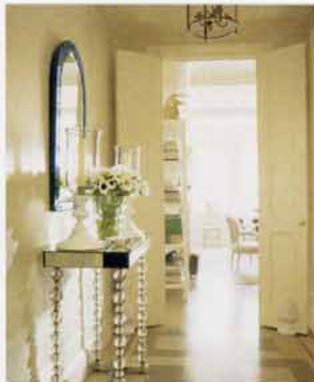
On the Cover A 1940s crystal-and-mirror console sparkles in the entrance hall of Timothy Whealon's Fifth Avenue apartment. "Eye of the Storm," page 156.